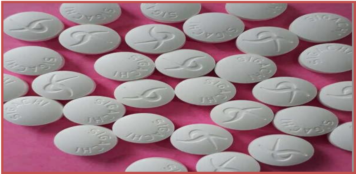
Fig.1. Acetyl salicylic acid tablets